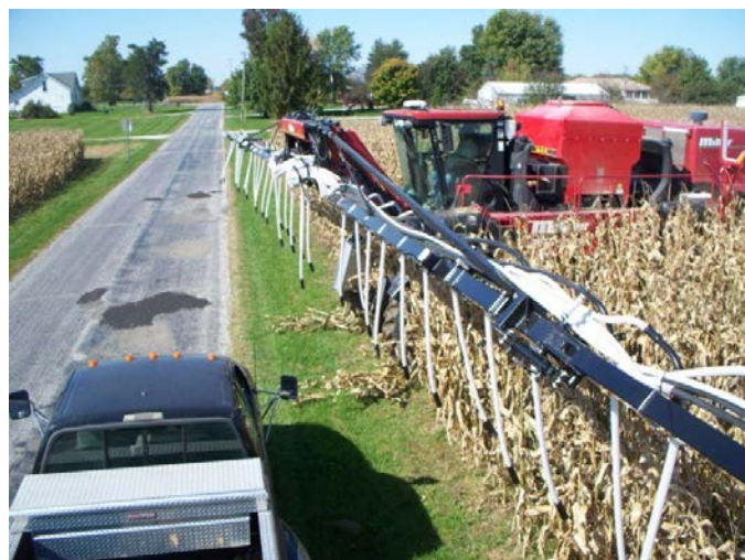
High clearance applicator converted for seeding cover crops- photo courtesy Mike Shuter

fertilizer or pelletized lime and utilizing an airflow applicator can also be effective.