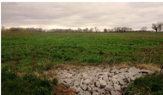
Field with cover crop showing no sign of runoff after a 2" rain event

Reduce Phosphorus Loss: Phosphorus loss from Indiana fields occurs in both soluble and particulate (i.e. attached to soil particles or organic manure or crop residues) forms. Cover crops reduce runoff of soluble phosphorus to surface water through increased infiltration and plant uptake. Particulate phosphorus loss is reduced by trapping organic residues and reducing soil erosion.