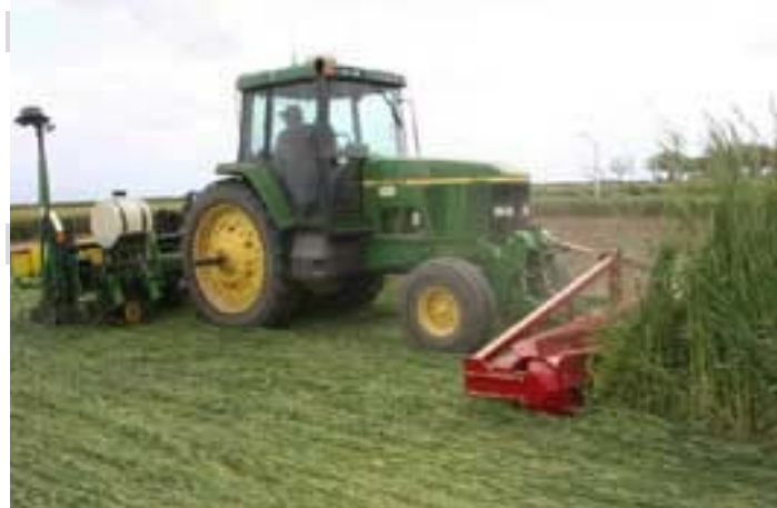
Using a roller-crimper to terminate headed out cereal rye

Mechanical: Most cereal grains are easily terminated by mowing, crimping, or tillage once the cover crop has reached a reproductive growth stage.